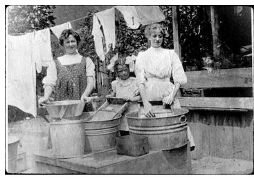
Laundry Day, c1900. Picture from Forks Timber Museum, WA.