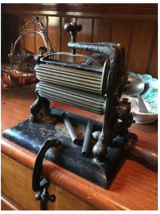
Rosson House pleating or crimping iron, used to press ruffles or pleats in clothing.

12) Back to square one with mending anything that wasn't fixed before washing, including darning socks, repairing rips, mending sagging hems, replacing lost beads and buttons, etc!