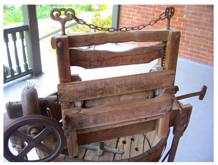
A 1900 Company Washing Machine, motor operated, with the slogan, "The 1900 Washer Saves Women's Lives". Heritage Square collection.

Information for this article was found in the Heritage Square archives: The American Pure Food Cook Book and Household Economist by David Chidlow (c1899); Mrs. Beeton's Book of Household Management (c1869): the 1895 and 1898 Phoenix City Directories; Library of Congress Chronicling America digital archive; the Homestead National Historical Park website (their info about the cold press mangle is really good); the Living History Museum; the Museum of History & Industry digital collection; Atlas Obscura; ThoughtCo; Penn Today; Bloomberg; Evolution of Home Appliances; and Statista.