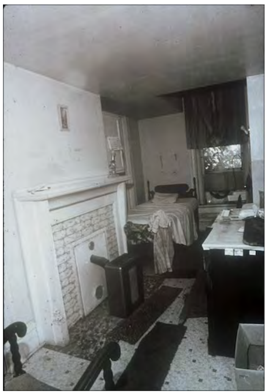
The Rosson House family parlor, prior to restoration.

Additional Info – Since you've gotten this far, we thought we'd give you a little more info about the Rosson House ceilings. When you look at some of the pictures or go on a tour, sometimes you'll see a metal disk in the ceiling, sometimes painted and sometimes not, and you'll think, "What is that??" The answer is that those