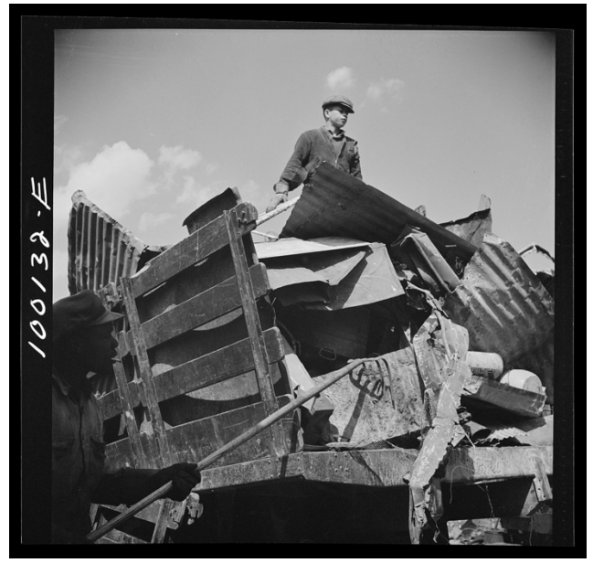
A boy stands on a pile of scrap metal during a World War II recycling drive. Do we see decorative metal ceiling panels directly under him??

"The pressed tin ceilings were badly chipped and had multiple layers of paint on the panels creating an "alligator" appearance. Several samples of paint were removed from the panels (the flat and raised areas) and looked at microscopically. The chips were sent to a paint laboratory in California for chemical analysis as to content and sheen of the bottom layer. Each room had a first layer of a soft green primer paint followed by an application of lead-based paint in a medium sheen. Next.