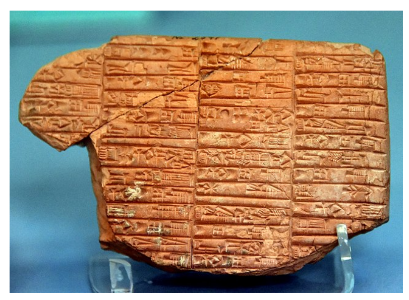
Clay tablet mentioning a list of goats, sheep, and lambs, dating to the 23<sup>rd</sup> century BCE, Nippur, Iraq (Ancient Orient Museum, Istanbul).

There is just something about being in a library surrounded by books – the smell, the sound of the pages turning, the seemingly infinite amount of knowledge and number of stories just waiting to be explored. But the first libraries and archives predated books, as people used clay tablets to record their histories and information. Clay tablets dating